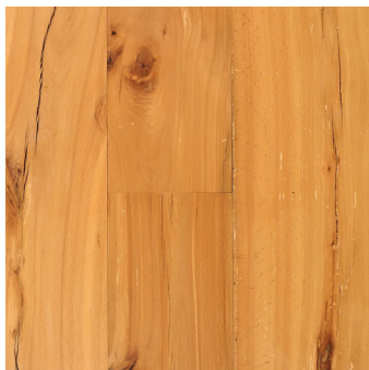
Oil-based Polyurethane On-Site Finish