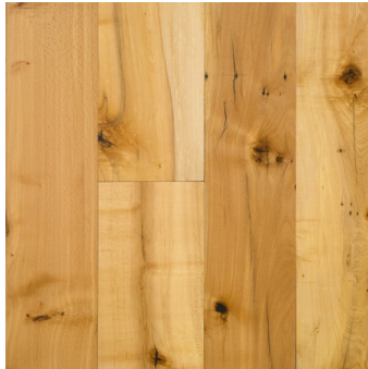
Water-based Polyurethane Prefinish