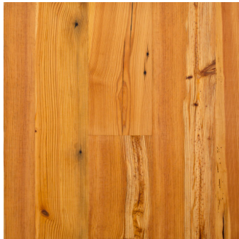
Natural Oil Prefinish