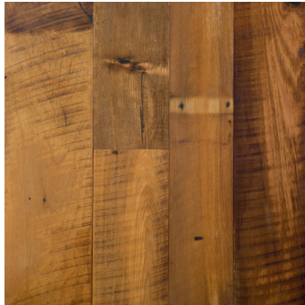
Water-based Polyurethane Pre-finish