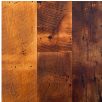
Natural Oil Pre-finish