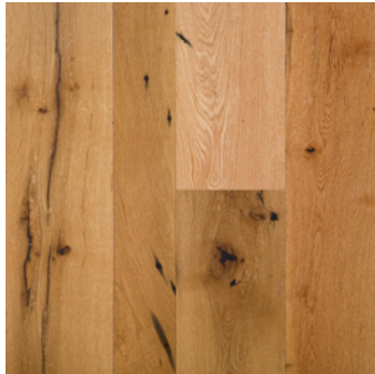
Water-based Polyurethane Prefinish