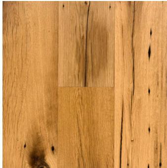
Water-based Polyurethane Prefinish