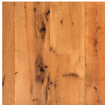
Natural Oil Prefinish