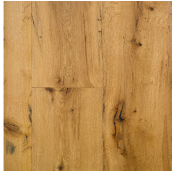
Water-based Polyurethane Prefinish