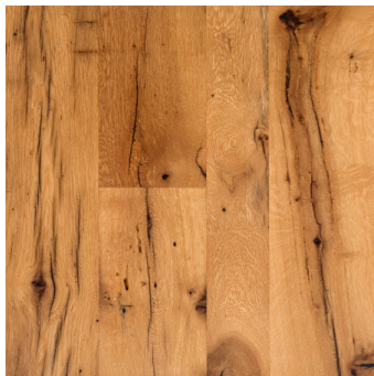
Natural Oil Pre-finish