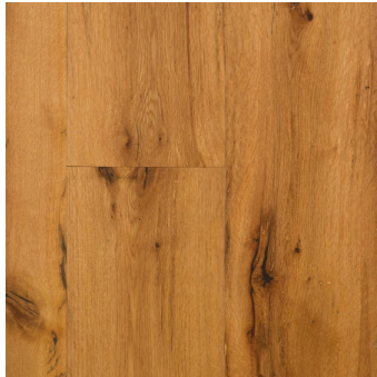
Water-based Polyurethane Pre-finish