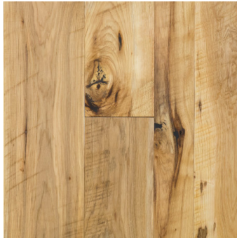
Water-based Polyurethane Pre-finish