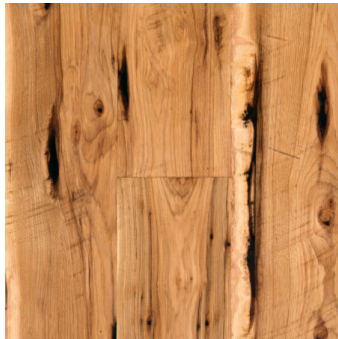
Natural Oil Pre-finish