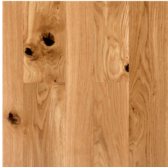
Water-based Polyurethane Pre-finish