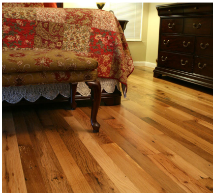
Reclaimed Antique Oak Engineered Flooring