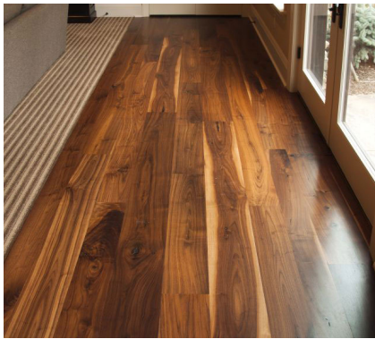
Traditional Plank Walnut Engineered Flooring